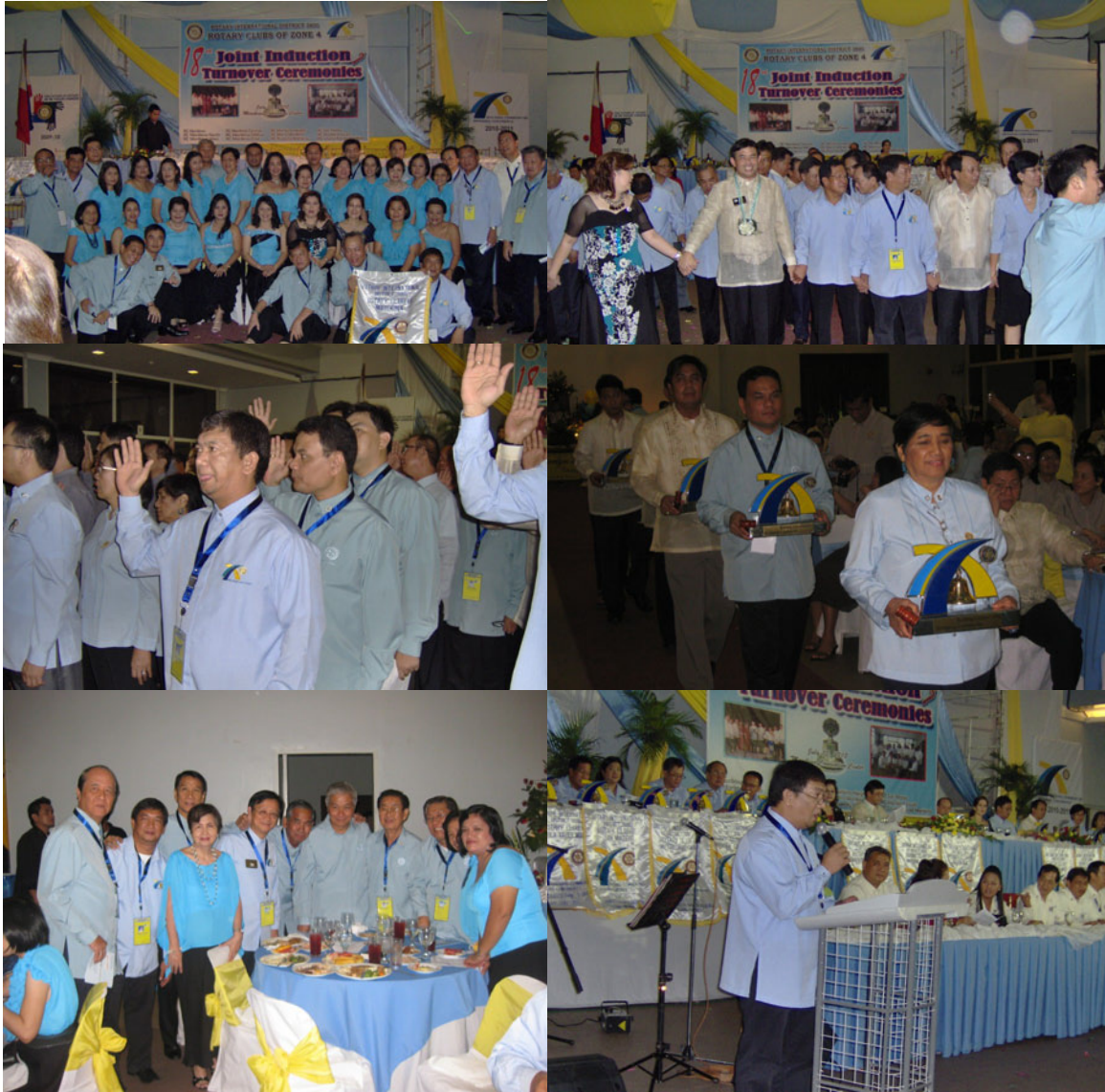
RC Marikina Rotarians and Spouses during the 18th Zone 4 Joint Induction last July 10, 2010, held at the Marikina Convention Center. About 65 Rotarians and Spouses attended the said event. Thank you for all the support! Godspeed!