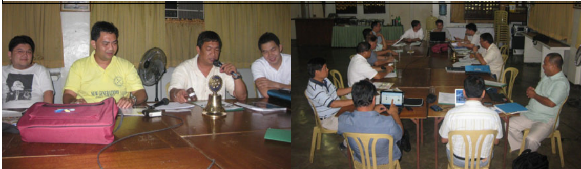
The first Board of Directors' meeting for RY 2010-2011 held last July 5, 2010 at MRYC with all board members present that evening.