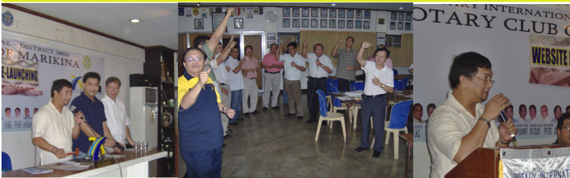
RC Marikina Rotarians during the 1st Rotary Meeting and the Website Re-Launching held last Thursday, July 15, 2010 at MRYC.