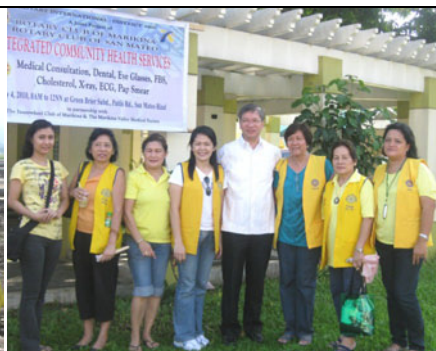
Inner Wheel Club of Marikina members with Mayor PE Del de Guzman during Tree Planting and Integrated Medical Mission last July 4, 2010 in San Mateo.