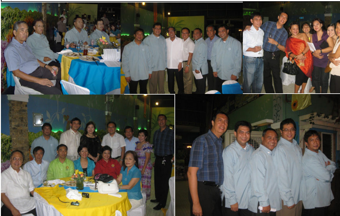
RC Marikina Rotarians with Zone 4 Visionary and Global Presidents and their spouses during the Club Awards and Handover Ceremonies of RC San Mateo last July 17, 2010 at Drop Zone, San Mateo Rizal.