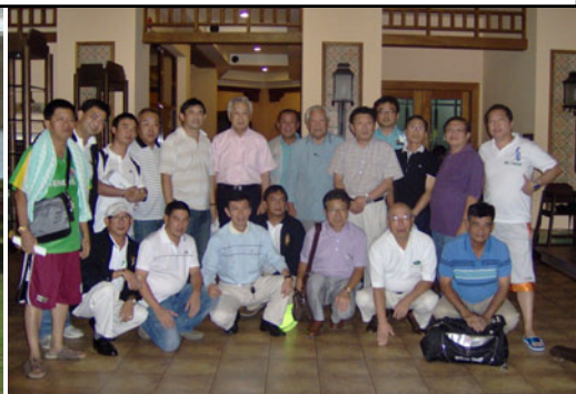
Fellowship Golf with Japanese Guests at Spondido Golf Course, Tagaytay. (07/25).