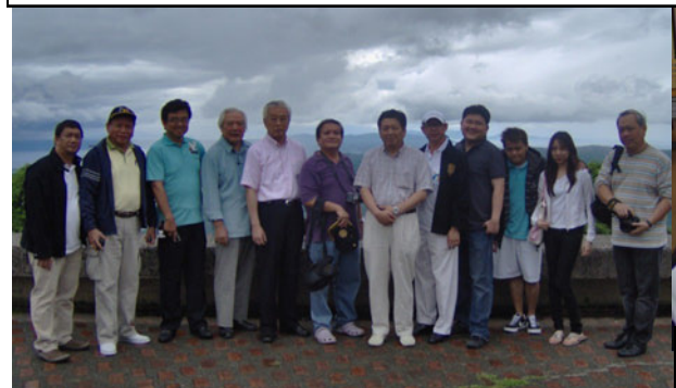
In Taal Vista Lodge. (07/25).