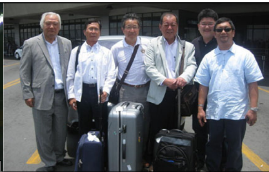
Send off of the Japanese guests to the airport last Monday, Jul. 26, 2010.