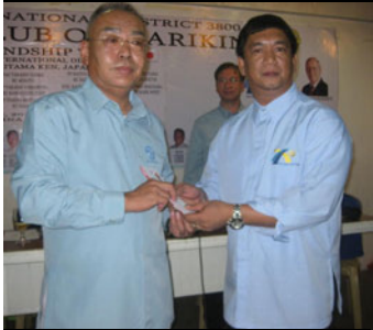
PAG Toujoh endorsing a donation from 2 of the members of RC Omiya East.