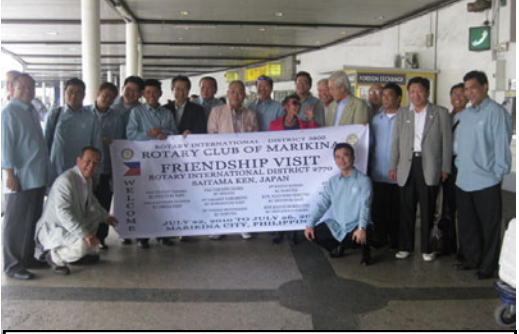
RCM members welcoming the arrival of D2770 Friendship visit delegates at NAIA Airport.