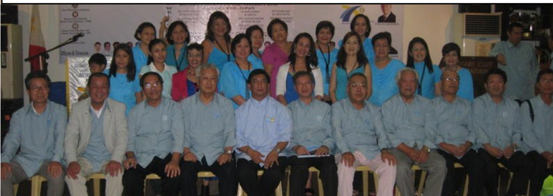
IWC members and Spouses with D2770 Friendship Visit Delegates during RC Marikina Ladies Night. (07/22)