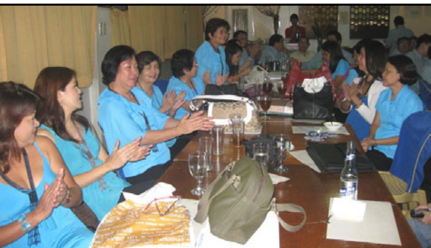
Inner Wheel Club of Marikina members and Spouses during RC Marikina Ladies Night. (07/22)