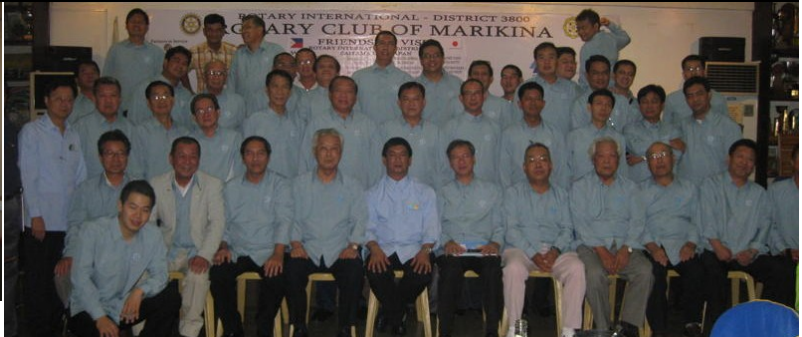
RC Marikina Rotarians with D2770 delegates during its visit to the club.