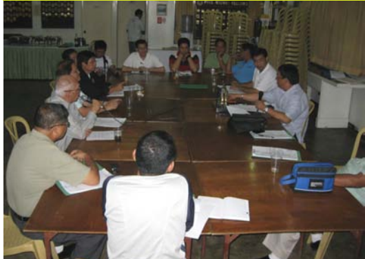
3rd Board Meeting at MRYC (09/06/10)