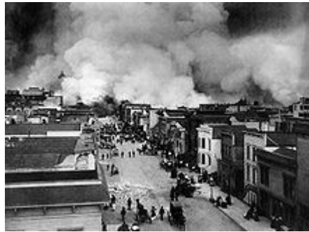
Fires of the 1906 San Francisco earthquake

Earthquakes can affect our lives in many ways. They cause fires that burn buildings to the ground. This affects you because now you have nowhere to live. They also can destroy whole towns. Family members can be trapped under the rubble inside the house. Now you will mourn for their loss. During an earthquake, tsunamis are created and destroy everything in their path at the beach. This includes buildings and any other of your favorite things to do at the beach. Now you are bored all the time until they get it repaired. If you live in a small town with only one store that supplies you with everything and it gets destroyed, what do you do? You will starve unless you can get help fast. Let's say your town is under a huge cliff. There suddenly is an earthquake, which causes a landslide. Everyone is buried alive. But if you live in a big city there is a great chance that you will survive. This is because it is so big and so populated with important stores that life could go on even if a huge earthquake occurs. So always be prepared for an earthquake.