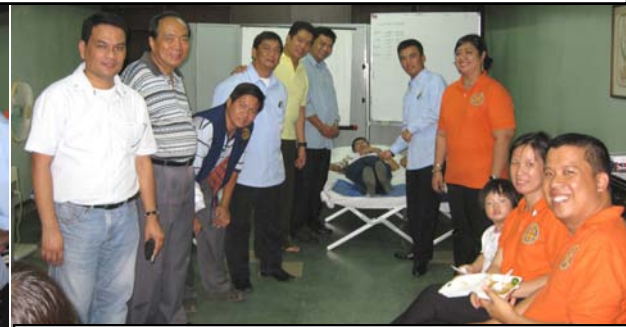
RC Marikina Rotarians with RC Metro Marikina Rotarians during Bloodletting Joint project.