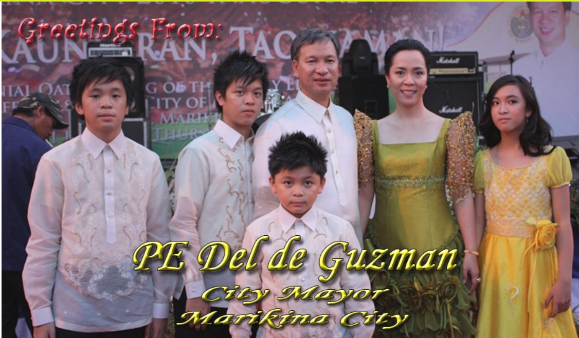
PE Del de Guzman City Mayor Marikina City