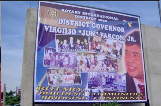
12 x 14 feet wide billboard of Gov. Jun Farcon