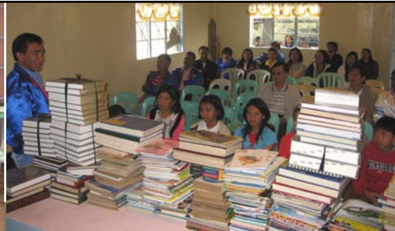
The different books, old and new donated by RC Marikina and RC Marikina South to Sinipsip Elem. School Library.