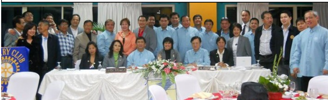
RC Baguio South members with the RC Marikina on-to-Baguio delegates .