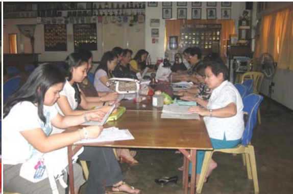
Board Meeting at MRYC (09/16/10)