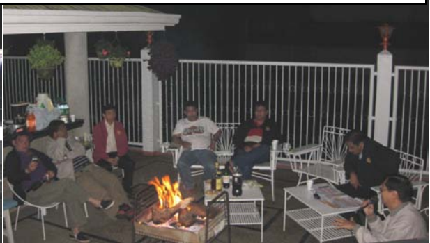
Rotarians during Fireside meeting with PP Eric giving some rotary information.