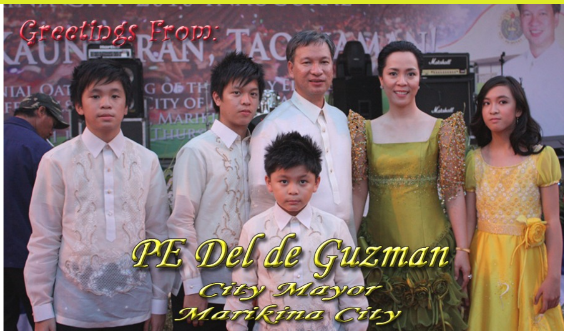
PE Del de Guzman City Mayor Marikina City