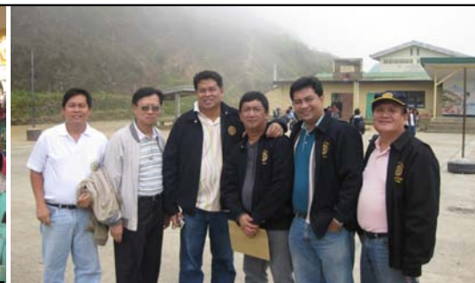
RCM Rotarians at the grounds of Sinipsip Elementary School.