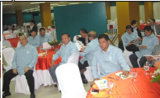
RC Baguio South regular club meeting at Baguio Country Club