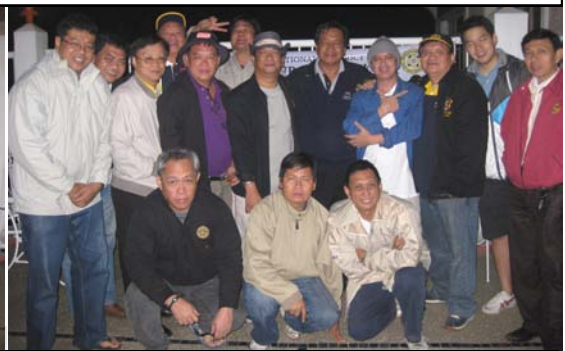
Rotarians who attended the fireside meeting in Baguio.