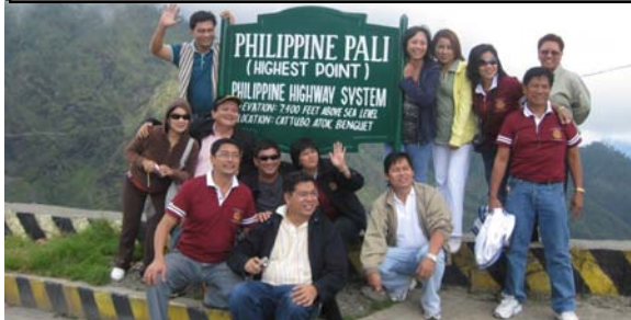
RCM Members with RC Baguio South members at the Cordillera Mountain.