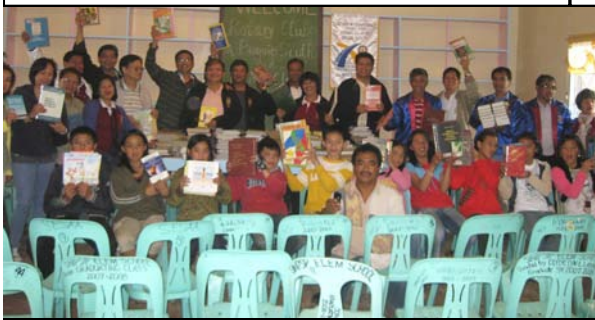
Rotary Clubs of Marikina and Baguio South members with some of the students beneficiary showing the books donated